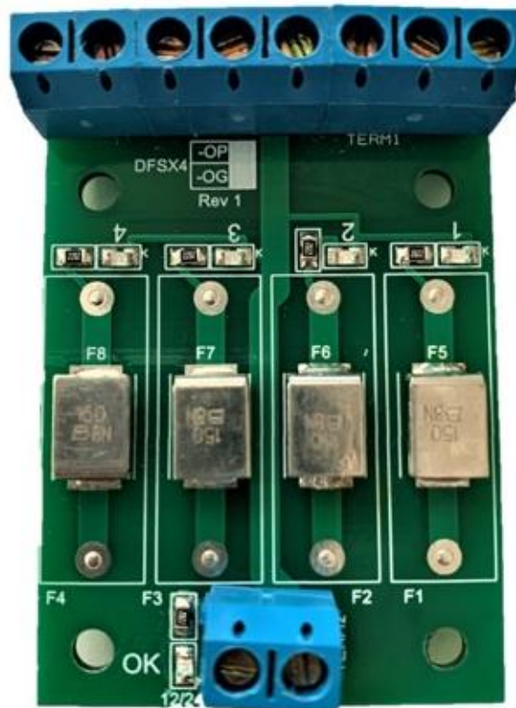
DFXS4-OP 4-way, self-resetting, electronically-fused output splitter

Dycon output splitters enable a single power supply unit to drive several different devices at the same time. The range consists of three different types of splitter that cover most system requirements. They take the dc power output from any Dycon, or most other make, 12Vdc or 24Vdc power supply and distribute it into four or eight protected outputs to drive peripheral systems components. The full range consists of an intelligent, electronically-fused 4-way, conventional glass-fused 4 and 8-way and a glass-fused unit with 4 x BNC loop-through video outputs for powering over-the-coax CCTV cameras each has two additional 1A conventional wired outputs. The DFXS4-OP, a four-output version ( shown above ), is protected by self-resetting, electronic fuses, each with a maximum rated output of 1.5A. These units have green LEDs to indicated when an output is powering normally.