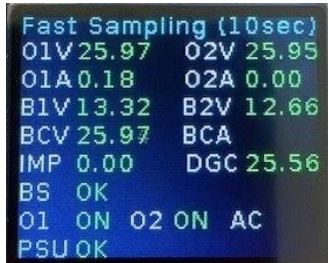
High speed sampling rate displays peak-to-peak voltages and current outputs of the connected equipment.