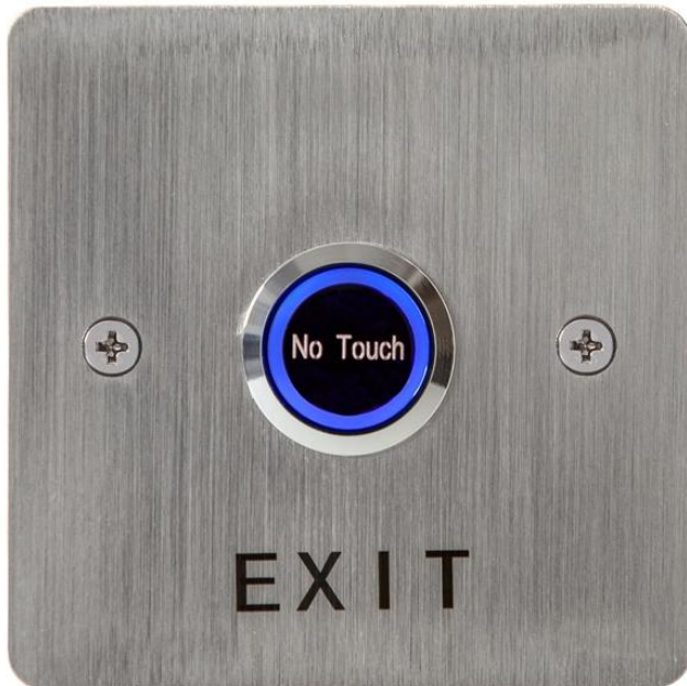
Normal 'Ready-for-Action' state