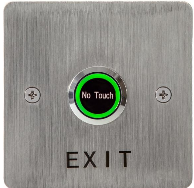
'Door Open' state when a hand or finger has been placed within 5-10 cm of button