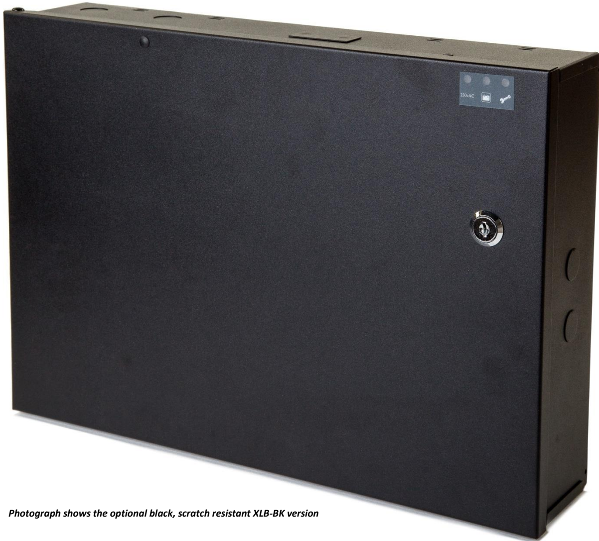
Photograph shows the optional black, scratch resistant XLB-BK version

A radically new concept in housing design for electronic systems